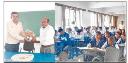
फॅबटेकमधील जीपॅट विषयावर चर्चासत्रात सहभागी मान्यवर व विद्यार्थी.

सांगोला, संकेत टाइम्स येथील फॅबटेक कॉलेज ऑफ फार्मसीमध्ये जीपॅट वरती एकदिवसीय चर्चासत्राचे आयोजन करण्यात आले होते.