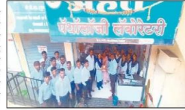
अर्हत पॅथॉलॉजी लॅबची पाहणी करताना फॅबटेक एडीएमएलटीचे विद्यार्थी.